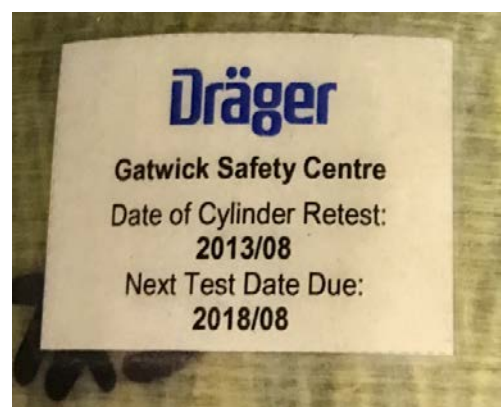
(Fig.4) Date of Final Use